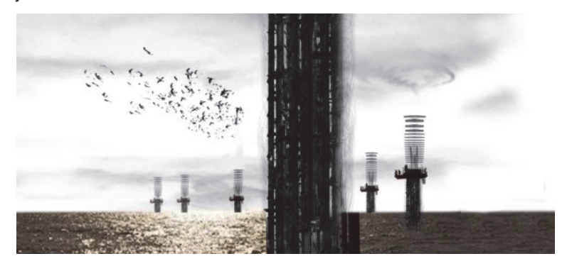
Figure 2: M9 Master Project 2013, Threshold of the Dream, Philharmonic, Natural Core of Belgrade, Mihailo Popović, UBFA

This state redefines relations of mind and body. Stephen Hawking foresees the possibility of immortality by replacing human body that would probably have a form of some type of computer, while Michel Houllebecq still deals with the issues of the right to disappear. If we live in times of redefinition of a relationship to human body, it must be that we are also participants in redefinition of construction of its spatial frame. We consider the other construction, still evolutionary considered as adjustment of nature to human, while structural role of architecture shifts from meta to infra. Concept of diminished visibility paradoxically enlarges its presence, and in renunciation from sublime we create conditions for sublimity of renunciation. On this line of understanding is also utopian idea of Jeremy Till according to which giving is made equal to freedom. If we leave aside pure philosophic implication of such approach, we are left to transfer architectural projection of future into the image of reality of its future context, instead of itself.