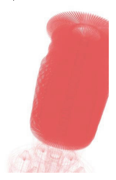
Figure 1: M9 Master Project, Fragment

Keywords: digital space, post-digital era, evolution, super-natural