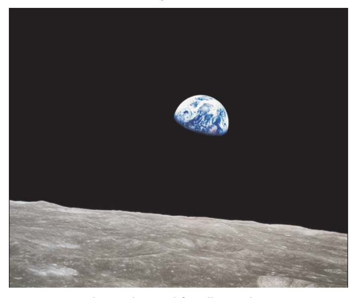
Figure 65: Earthrise - photograph by William Anders, NASA, 1968.

Modernists placed great importance on the aerial view. Their relationship with zenithal perspective was described by Nadar<sup>256</sup>, creator of the very first aerial photograph, who said that cities and landscapes, from above, look like a toy-land, inviting one to play<sup>257</sup>. Modernists assigned a negative connotation to the aerial view, as it depicted urban disorder, but at the same time they saw the aerial view as a perfect tool for this chaos to be arranged and controlled.