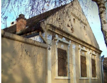
Figure 3: Ethno house SDAR- source: https://vojvodinaonline.com/smestaj/etno-kuca-sdar-dolovo/ , March 1st, 2019.

Casa Verde is situated in Romania. The concept of this project is all about healthy, cheap and sustainable way of building in natural areas, untouched by civilization. A material used straight from the backyard, is earth. Ileana Mavrodin, architect and natural builder, showed how to make a house from the scratch using cob. Cob is the result of mixing earth, sand and straw. The experience of using cob goes beyond and shows how you can freely use both hands and feet to model the house. This house is a place for different workshops Ileana made, when food is provided by local people from their own sustainable farms (Figure 5).