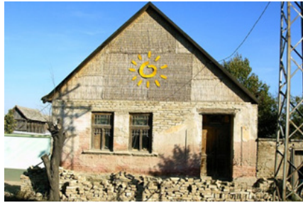
Figure 1: Moshorin House