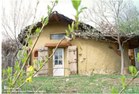
Figure 5: Casa Verde

a patio is opened in the south. The passive solar design, combining big windows in the south face, little ones in the windows in the north and skylights with earth walls, ensures thermal comfort, natural light and cross ventilation. These passive design principles maximize sunlight access through the south facade improving benefits of earthen walls thermal mass. In winter, nowadays, Mokrin house represents rural coworking space. Its an urban point in the rural surrounding (Figure 6).