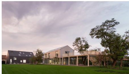
Figure 6: Mokrin House