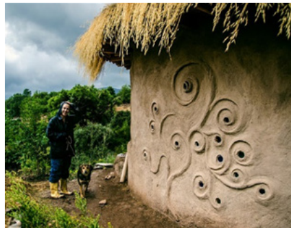
Figure 4: Mud House- source http://www.themudhome.com/ , March 1st, 2019.