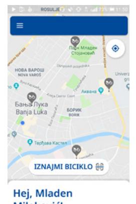
Figure 1: Nextbike sharing system and screen with map of Banjaluka

Nicholas Law introduces the concept of an active city, in which a man provides a natural movement or motion. "The central zones of many European cities are now mostly pedestrians and cyclists" (Law, 2003, p. 6). Construction of new caravans and bridges for car traffic is not a solution. "Adding a freeway lane to solving the traffic jam problem is just like giving up a fight in