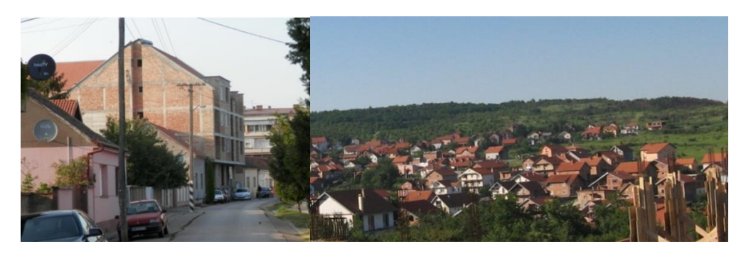
Figure 2. The negative consequences of the post-socialist transformation of housing in Serbia: new multi-family building on overbuilt plots in Sremska Mitrovica

A further significant issue in Serbia is the management and maintenance of multi-family buildings ('condominiums'). This kind of building accounts for approximately 30% of total housing stock in Serbia (Petovar & Mojović, 2006). The process of housing privatisation has caused a range of problems regarding management and maintenance of joint-ownership spaces such as communication corridors, roofs and facades of condominiums. Appropriate legislative acts have not resolved these issues. Moreover, implementation of legislation has also been weak and incomplete. Therefore, the state of the existing housing stock depends almost solely on their individual owners (Mojović & Žerjav, 2011). In most cases, this has not been a sufficient solution to ensure the maintenance of buildings in good condition. However, this confused housing situation has produced some positive effects; specifically, it has prevented residential segregation, spatial fragmentation and gentrification, which has been a typical feature of those post-socialist countries with a better economic performance (Stanilov, 2007).