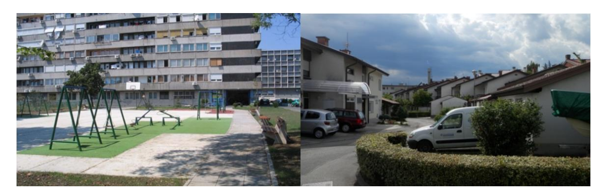
Figure 1. Two different types of publicly developed housing in socialist Yugoslavia: multi-family housing in New Belgrade, Serbia (left), and terraced houses in Nova Gorica, Slovenia (right).