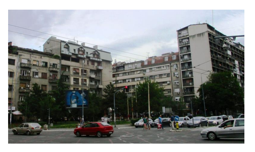
Figure 3. Examples of top-located extensions of socialist buildings in Serbia.