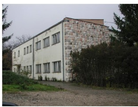
Figure 2. Administrative building of the mining complex in the village of Vina, Eastern Serbia

A similar fate is also characterized the Kalna village in the municipality of Knjaževac, Serbia. At the time of the socialist government in early 60s here were opened industrial facility for processing uranium ore. Following the example of socialist practice it was built the entire village from the production facilities to residential buildings for workers [Aranđelović, Videnović, 2016:69]. After less than five years the mine was abandoned and many buildings from that time have no purpose today.