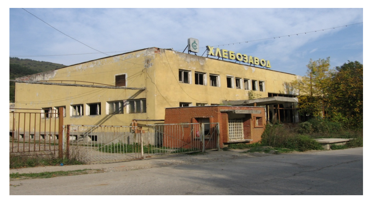
Figure 3. Facility of food industry, Čuprene, Bulgaria